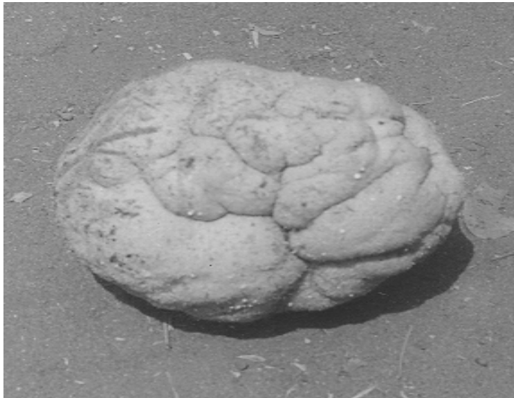
Plate 2: Treculia africana Fruit