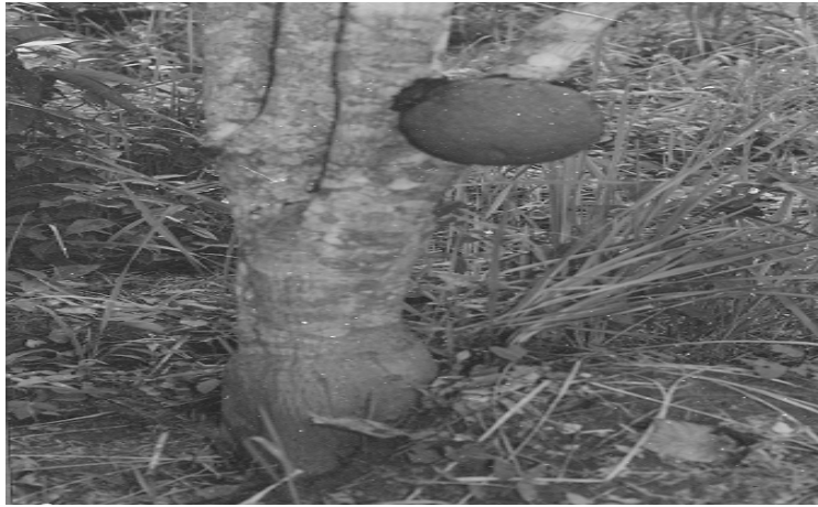
Plate 1: Treculia africana tree bearing fruit on the main trunk.